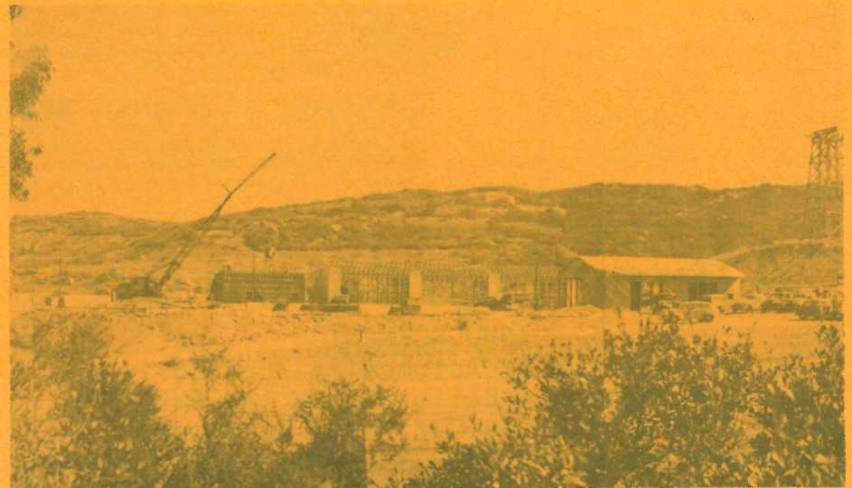
ALPINE'S FINE NEW UNION GRAMMAR SCHOOL RISES ON HIWAY 80.

Editor's note:-Many have been annoyed by incessantly barking dogs which disturb sleep, annoy daylight hours, but the warning bark of a good dog is a reassuring sound and should not bother any normal person. But none should be so base as to place awful poison in morsel of meat to murder a valuable dog for this or any other reason. We hope Alpine is not in for a round of this fiendish sport.